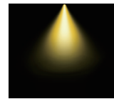
3500K NEUTRAL WHITE LIGHT