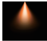
2700K SOFT WHITE LIGHT