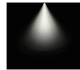
4000K COOL WHITE LIGHT