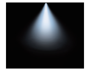
5000K DAY LIGHT